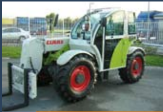
1170513 Claas Targo C 50

Yr. 2002, GBP 20,825.00, Maschinenhandel Höing, Tel.: +49 2542 955555, +49 171 3823488, info@mhg-maschinen.com, Cab, Hydraulic attachment locking system