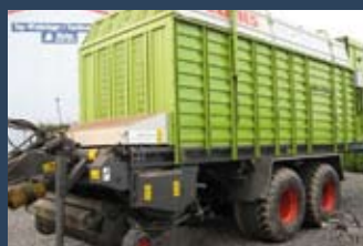
1170413 Claas Quantum 5500S