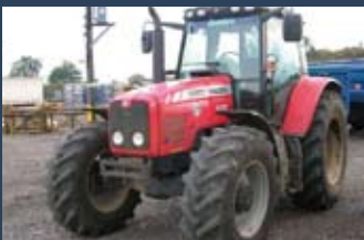
1014506 Massey Ferguson 6480

Yr. 2008, GBP 46,000.00, Chandlers (Farm Equipment) Ltd, Tel.: +44 1476 590 077, gavin.pell@chandlersfe.co.uk, Air-conditioning, all-wheel-drive, Cab