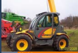
1065973 Dieci Samson 45.8

G M Stephenson, Tel.: +44 1723 891 487, +44 7831 565 473, info@gmstephenson.co.uk, 50K air / hyd brakes air cab susp. 4 spools 2790 hrs 90 % tyres very tidy