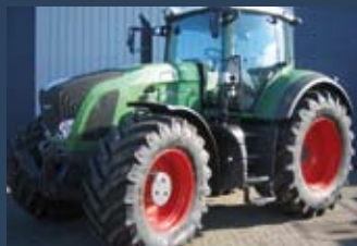
1170775 Fendt Favorit 930 Vario