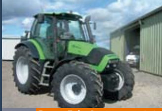
1172428 Deutz-Fahr Agrotion 150.6

Yr. 2003, GBP 15,750.00, Peirsons Ltd, Tel.: +44 1630 638 477, +44 7710 510 446, peirsons@tiscali.co.uk, all-wheel-drive, Cab, Front-end loader