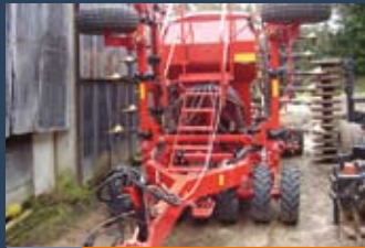
1142451 Horsch ST6 Sprinter