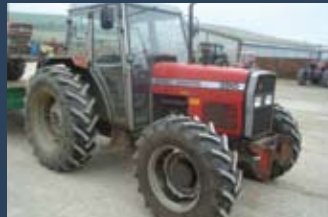
1172141 Massey Ferguson 390