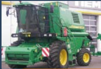
1170165 John Deere 1550WTS

Yr. 2006, GBP 79,900.00, A1-Traktor.de, Tel.: +49 4282 9327 35, kontakt@a1-traktor.de, Air-conditioning, Cab, Chaff spreader, Header trailer