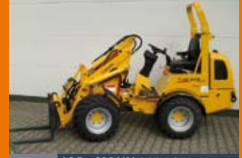
1061842 JOB - MANN 200 - 35

Yr. 2005, GBP 27,795.00, Maschinenhandel Höing, Tel.: +49 2542 955555, Tel.: +49 171 3823488, info@mhg-maschinen.com, Auxiliary hydraulic circuit, Cab, Pin-hitch