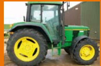
1160880 John Deere 6100