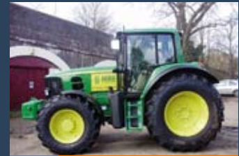
1179784 John Deere 6930P

Yr. 2008, GBP 61,000.00, autoquad plus lhr 20/20 50k, mfwd axle tls plus & brakes, hcs plus, Ben Burgess & Co, Tel.: +44 1603 628 251, enquiries@benburgess.co.uk,