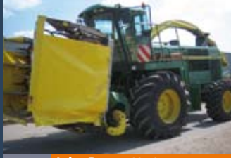
1168087 John Deere 6950

Yr. 2009, GBP 58,500.00, Ben Burgess & Co, Tel.: +44 1603 628 251, enquiries@benburgess.co.uk, powrquad plus lhr 20/20 40k, mfwd front axle - with tls plus, hcs plus