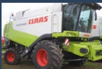
1013920 Claas Lexion 560

Speedstar, Yr. 2006, GBP 115,000.00, Fricke Landtechnik GmbH, Tel.: +49 3998 272912, +49 171 8628146, Matthias.Klaiber@Fricke.de, Air-conditioning, Automatic lubrication