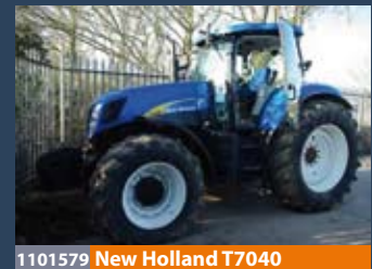
1101579 New Holland T7040

Yr. 2008, GBP 36,300.00, Richard Bland Tractors, Tel.: +44 1743 366 956, +44 7860 505 945, sales@richardbland.co.uk, Air brakes