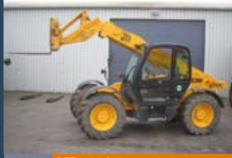
1134389 JCB 530/70

Yr. 2001, GBP 16,929.00, Maschinenhandel Höing, Tel.: +49 2542 955555, +49 171 3823488, info@mhg-maschinen.com, Air-conditioning, Auxiliary hydraulic circuit