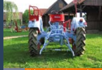
1171305 Eicher EM 100 Leopard

Yr. 2007, GBP 35,000.00, J E Buckle Engineers Ltd, Tel.: +44 1438 861 257, gary@jebuckle.co.uk, Air-conditioning, Auxiliary hydraulic circuit, Cab, Hydraulic attachment locking system