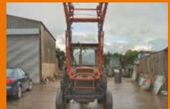
1165997 Case IH 685 -2WD

Yr. 2009, GBP 76,500.00, Machine Link Ltd, Tel.: +44 1608 645 637, +44 7974 507917, guy@machinelink.co.uk, Air-conditioning, all-wheel-drive, Cab