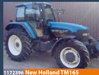
1172396 New Holland TM165