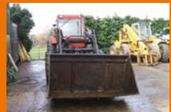
1153098 Zetor 12145-4wd Yr. 1995, GBP 8,500.00, Peirsons Ltd, Tel.: +44 1630 638 477, +44 7710 510 446, peirsons@tiscali.co.uk, all-wheel-drive, Cab, Front-end loader