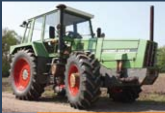
1168639 Fendt 622LSA

Yr. 2007, GBP 46,000.00, Redlynch Agricultural Engineering Ltd, Tel.: +44 1749 812 628, +44 7702 000 001, sales@redlynchtractors.co.uk, Air-conditioning, 4wd