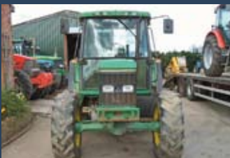
1154595 John Deere 6100-4wd

Yr. 1997, GBP 12,000.00, C E Davis & Co Ltd, Tel.: +44 1225 891 444, +44 7831 623 701, sales@cedavis.co.uk, all-wheel-drive, Cab, Sensible houred example.