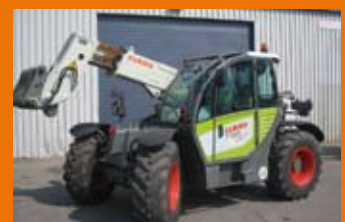
1157070 Claas Scorpion 7030

Yr. 2002, GBP 17,000.00, Air brake, Automatic filling, Marxen Landtechnik GmbH & Co, KG, Tel.: +49 4883 90 56 73, +49 171 725 59 15, info@marxen-landtechnik.de