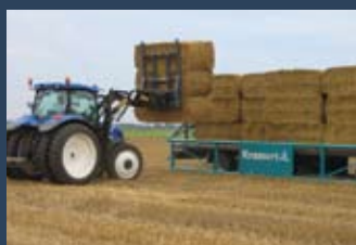
1142368 Front loader attachment

GBP 7,950.00, Southmoor Farm Machinery, Tel.: +44 1363 83 210, +44 7813 848 728, neil@sfrmsales.eclipse.co.uk, Tidy