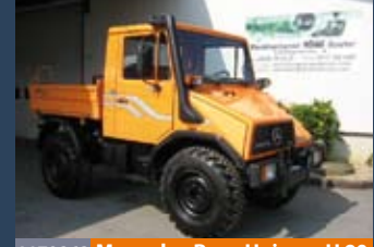
1170862 Mercedes-Benz Unimog U 90

Yr. 2002, GBP 49,300.00, Maschinenhandel Höing, Tel.: +49 2542 955555, +49 171 3823488, info@mhg-maschinen.com, all-wheel-drive, Cab, Hydraulic steering assistant