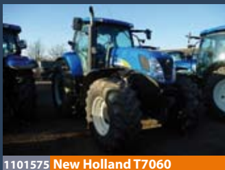
1101575 New Holland T7060

Yr. 2008, GBP 47,900.00, Richard Bland Tractors, Tel.: +44 1743 366 956, +44 7860 505 945, sales@richardbland.co.uk