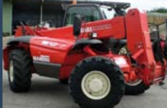
1154543 Manitou MVT 665

Yr. 2007, GBP 72,000.00, C H SHAW & SONS, Tel.: +44 7949 078781, +44 7949 078781, lionel@chshaw.co.uk, swather tractor complete with 10.5 metre 972 drive, mint condition