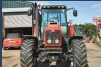
1165991 Massey Ferguson 6480

Yr. 2001, Boccasion, Tel.: +44 1673 885 200, +44 7831 240 000, olivier@boccasion.com, dynashift, front suspension, 3 hyd spools, 40km