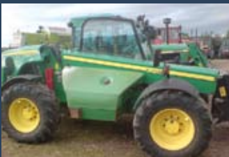
1172389 John Deere 3420

Yr. 1977, GBP 3,950.00, Peirsons Ltd, Tel.: +44 1630 638 477, +44 7710 510 446, peirsons@tiscali.co.uk, all-wheel-drive, Cab, OPU CAB