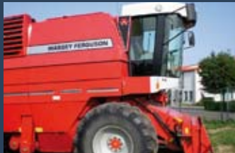
1127502 Massey Ferguson 36RS