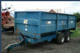
1109593 AS Marston 10 Ton Tandem

GBP 2,500.00, C E Davis & Co Ltd, Tel.: +44 1225 891 444, +44 7831 623 701, sales@cedavis.co.uk, Border spreading facility, Cover, Hydraulic operation