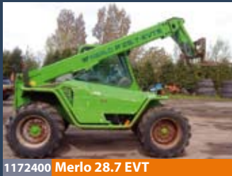
1172400 Merlo 28.7 EVT

Yr. 1995, GBP 16,914.00, Maschinenhandel Höing, Tel.: +49 2542 955555, +49 171 3823488, info@mhg-maschinen.com, all-wheel-drive, Cab, Front pto, Hydraulic steering