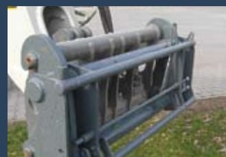
1142374 Quick attach carriage