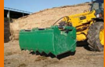
1014428 Albutt Sheargrab