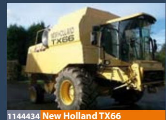
1144434 New Holland TX66

GBP 16,500.00, Southmoor Farm Machinery, Tel.: +44 1363 83 210, +44 7813 848 728, neil@sfmsales.eclipse.co.uk, W reg, 40k, power command, air con, super steer