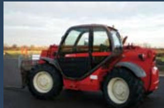
1115377 Manitou MT 932