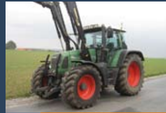
1010858 Fendt 712 Vario

Yr. 1983, van Dijk, Tel.: +31 493 313107, mark@vdie.nl, Air-conditioning, all-wheel-drive, Cab, ELC, Hydraulic steering assist system, Pneumatic system