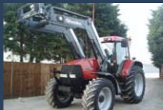
1172138 Case IH MX135