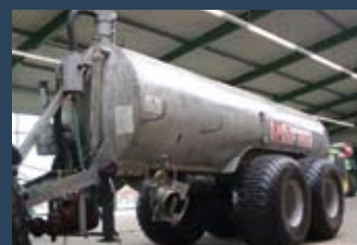
1168185 Garant VT 16000/5

Yr. 2009, Krassort Maschinen & Anlagenbau GmbH, Tel.: +49 2583 300920, kontakt@krassort.com