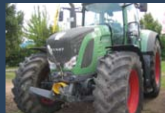
975419 Fendt Favorit 930 Vario-P