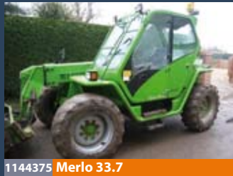
1144375 Merlo 33.7

Yr. 2001, GBP 12,950.00, Southmoor Farm Machinery, Tel.: +44 1363 83 210, +44 7813 848 728, neil@sfmsales.eclipse.co.uk, pallet forks