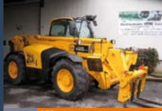
1167934 JCB 535-125