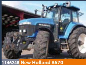
1146248 New Holland 8670

Yr. 2008, Cooks Midlands Ltd, Tel.: +1 1530 249 191, +1 7966 261 818, bill@cooksmidlands.co.uk