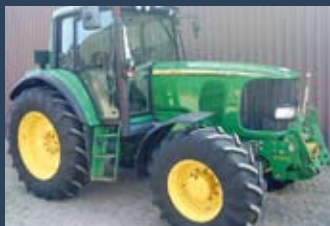
1172386 John Deere 6620