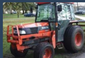
1119990 KUBOTA L4200

Yr. 2009, Krassort Maschinen & Anlagenbau GmbH, Tel.: +49 2583 300920, kontakt@krassort.com