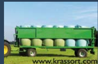
391396 Krassort bale trailer

Yr. 2009, Krassort Maschinen & Anlagenbau GmbH, Tel.: +49 2583 300920, kontakt@krassort.com, Air brake