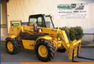
1167922 JCB 526 S