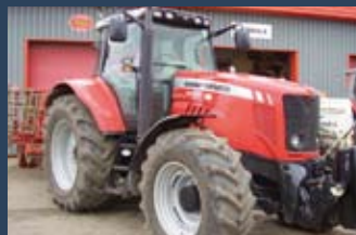
1157413 Massey Ferguson 6490

Dyna 6 Tier 3, Yr. 2006, GBP 45,750.00, Chandlers (Farm Equipment) Ltd, Tel.: +44 1476 590 077, gavin.pell@chandlersfe.co.uk, c/w Comfort Pack