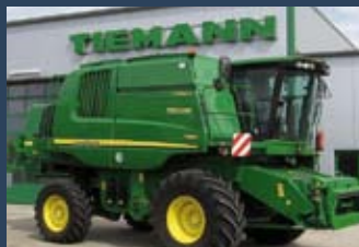
1107058 John Deere T660 HM