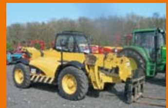
1160834 Caterpillar TH355B