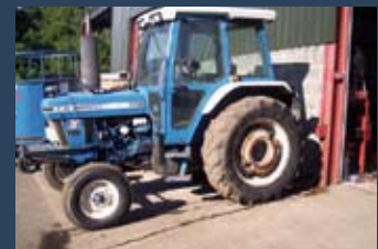
1175494 Ford 6810