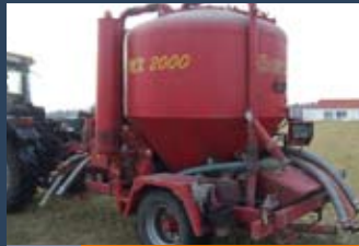
1171658 Daweke MX 2000

Yr. 2002, GBP 20,825.00, Maschinenhandel Höing, Tel.: +49 2542 955555, +49 171 3823488, info@mhg-maschinen.com, Cab, Hydraulic attachment locking system