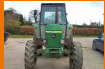
1151853 John Deere 3130-4WD

Yr. 1991, GBP 4,750.00, Peirsons Ltd, Tel.: +44 1630 638 477, +44 7710 510 446, peirsons@tiscali.co.uk, Air-conditioning, all-wheel-drive, Cab