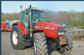
1160725 Massey Ferguson 6290