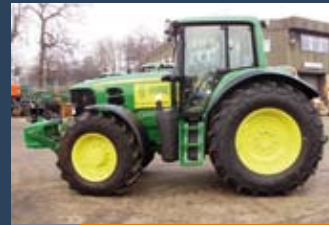
1179785 John Deere 6930P

Yr. 2009, GBP 66,500.00, autopowr 50km, mfwd axle tls plus & brakes, hcs plus, 2x 300 series scv, Ben Burgess & Co, Tel.: +44 1603 628 251, enquiries@benburgess.co.uk