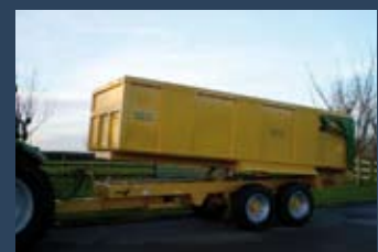
1135294 Ranch 14 ton

Yr. 2009, Krassort Maschinen & Anlagenbau GmbH, Tel.: +49 2583 300920, kontakt@krassort.com