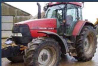
1119922 Case IH MX135

Yr. 1987, GBP 7,450.00, H J Knight & Son, Tel.: +44 1243 575333, +44 7850 856150, hjk.eastashling@yahoo.co.uk, Cab, Front-end loader, Hydraulic steering assist