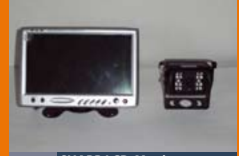
812251 SHARP LCD-Monitor Yr. 2009, GBP 211.00, Landtechnikzubehör Pregler, Tel.: +49 9971 76 66 77, +49 170 96 68 756, pregler2@vr-web.de