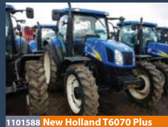
1101588 New Holland T6070 Plus

Yr. 2002, GBP 27,200.00, A1-Traktor.de, Tel.: +49 4282 9327 35, kontakt@a1-traktor.de, Air-conditioning, all-wheel-drive, Cab, Creeper, ELC, Front axle suspension