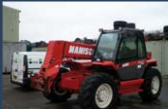
1115341 Manitou MT 845 Turbo

GBP 22,950.00, R E S Tractor & Mach Services, Tel.: +44 1949 861615, carole@restractors.co.uk, 4400 hrs, tyres front and back 20%