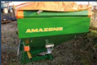
1111297 Amazone ZAX 1402