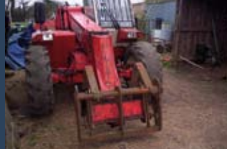
1136803 Manitou 725

Yr. 2003, R E S Tractor & Mach Services, Tel.: +44 1949 861615, carole@restractors.co.uk, c/w pallet tines, 2003 machine, low hours, very clean