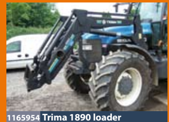
1165954 Trima 1890 loader GBP 3,500.00, (TM & 60 Series Brackets) Parallel linkage. Trima head stock., Edwards Machinery Ltd, Tel.: +44 7855 301 107, rob@glammachinerysupplies.co.uk