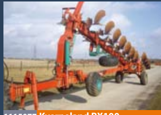
1115077 Kverneland RX100

GBP 12,500.00, Edwards Machinery Ltd, Tel.: +44 7855 301 107, rob@glammachinery-supplies.co.uk, 5 Furrow Reversible Plough. Number 8 bodies. Hydraulic front furrow