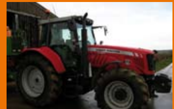
1139101 Massey Ferguson 6480

Yr. 2004, GBP 26,750.00, Peirsons Ltd, Tel.: +44 1630 638 477, +44 7710 510 446, peirsons@tiscali.co.uk, Air-conditioning, all-wheel-drive, Cab, Front axle suspension