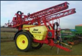
1115096 Rau Ikaurus A28 Yr. 2007, GBP 16,900.00, J Brock & Sons, Tel.: +44 1371 830 353, info@jbrockandsons.com, rocrop wheels