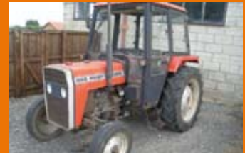
1172437 Massey Ferguson 240