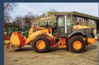
1179762 Hitachi ZW180

Yr. 2002, GBP 19,550.00, A1-Traktor.de, Tel.: +49 4282 9327 35, kontakt@a1-traktor.de