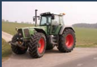
1152633 Fendt 824

Yr. 2003, GBP 43,950.00, Chandlers (Farm Equipment) Ltd, Tel.: +44 1476 590 077, gavin.pell@chandlersfe.co.uk, all-wheel-drive