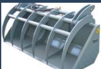
448696 Krassort feed bucket

Yr. 2009, Krassort Maschinen & Anlagenbau GmbH, Tel.: +49 2583 300920, kontakt@krassort.com, Air brake