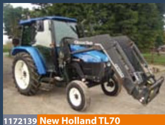
1172139 New Holland TL70

Yr. 2008, GBP 55,500.00, Richard Bland Tractors, Tel.: +44 1743 366 956, +44 7860 505 945, sales@richardbland.co.uk