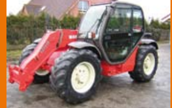
1161172 Manitou MLT 629 T

Yr. 1991, GBP 7,000.00, H J Knight & Son, Tel.: +44 1243 575333, +44 7850 856150, hjk.eastashling@yahoo.co.uk, c/w pallet tines PUH Needs tyres all round.