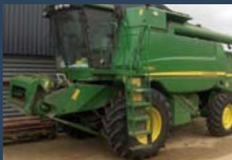
1065963 John Deere T550i

Yr. 2008, GBP 158,000.00, 625 cutting platform, 480/80r26, 800/65r32 goodyear, 179 drum hrs, Ben Burgess & Co, Tel.: +44 1603 628 251, enquiries@benburgess.co.uk