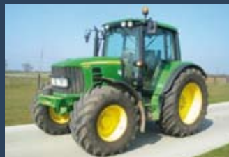
1163833 John Deere 6430 Premium

Yr. 2001, GBP 19,643.00, Maschinenhandel Höing, Tel.: +49 2542 955555, +49 171 3823488, info@mhg-maschinen.com, all-wheel-drive, Cab, ELC, Hydraulic steering