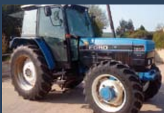
1175061 Ford 7840 SLE

Yr. 1989, GBP 5,250.00, H J Knight & Son, Tel.: +44 1243 575333, +44 7850 856150, hjk.eastashling@yahoo.co.uk, Cab, Hydraulic steering assist system