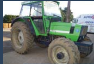
1172439 Deutz-Fahr 450