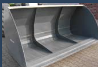
1142355 Krassort feed bucket

Yr. 2009, Krassort Maschinen & Anlagenbau GmbH, Tel.: +49 2583 300920, kontakt@krassort.com