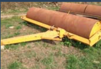
1165955 Twose Leading Roller GBP 1,500.00, Edwards Machinery Ltd, Tel.: +44 7855 301 107, rob@glammachinerysupplies.co.uk, 10 ft wide. 30" diameter. Only a few years old.