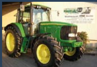
1168351 John Deere 6620 Premium

Yr. 2005, GBP 27,250.00, Southmoor Farm Machinery, Tel.: +44 1363 83 210, +44 7813 848 728, neil@sfmsales.eclipse.co.uk, 40k, auto quad, air con, good tyres