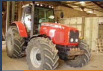
1176319 Massey Ferguson 6499