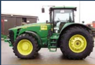
1179787 John Deere 8430