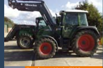
1172144 Fendt 312 Vario TMS

Yr. 1963, GBP 2,550.00, Tel.: +385 1 2451219, +385 98 231165, pcurkovic@inet.hr, Tractor is great.