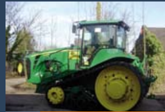
1179764 John Deere 8430T