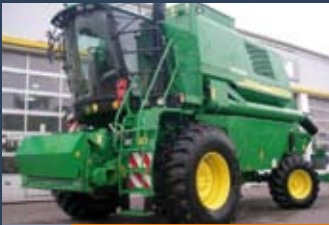
1119881 John Deere 1550WTS

Yr. 2008, HEP Gabelstapler GmbH, Tel.: +49 2152 987210, +49 151 11588675, info@hep-gabelstapler.de, Auxiliary hydraulic circuit, Hydraulic attachment