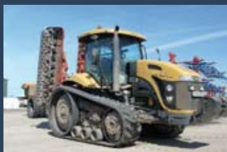
1165176 Challenger MT765B

Yr. 2004, GBP 62,000.00, Chandlers (Farm Equipment) Ltd, Tel.: +44 1476 590 077, gavin.pell@chandlersfe.co.uk, f/w Chafar 500L Spray Pack, 30m Twin Fold Boom