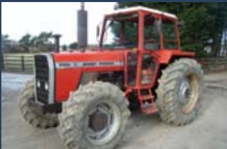
1172438 Massey Ferguson 298