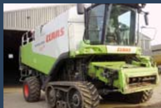
1179675 Claas 580 LEXION

Yr. 2006, GBP 92,000.00, Chandlers (Farm Equipment) Ltd, Tel.: +44 1476 590 077, gavin.pell@chandlersfe.co.uk, Air-conditioning, Cab