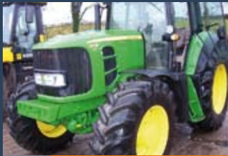
1145224 John Deere 6830 Premium

Yr. 2008, McGill Tractors, Tel.: +44 2820 762 749, +44 7703 605 744, mcgilltractors@aol.com, Auto Quad, Air Brakes