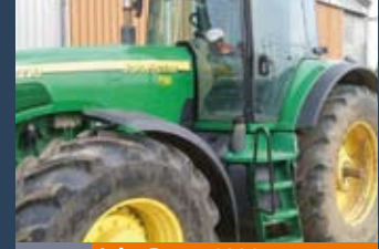
1173461 John Deere 8220

Yr. 2008, Boccasion, Tel.: +44 1673 885 200, +44 7831 240 000, olivier@boccasion.com, Air-conditioning, ILS front suspension, 40km/h