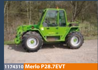
1174310 Merlo P28.7EVT