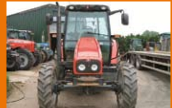
1173521 Massey Ferguson 5455-4wd