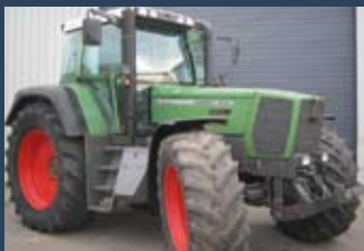
1163603 Fendt Favorit 824

Yr. 2007, GBP 95,000.00, Redlynch Agricultural Engineering Ltd, Tel.: +44 1749 812 628, +44 7702 000 001, sales@redlynchtractors.co.uk, Air-conditioning, 4wd