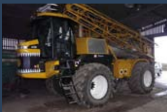
1176326 Challenger 618 Rogator

Yr. 2005, Boccasion, Tel.: +44 1673 885 200, +44 7831 240 000, olivier@boccasion.com, 3 tonnes to 12m with jack legs. genuine hours and a very genuine truck