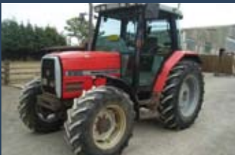
1172133 Massey Ferguson 6120 Dyna

Yr. 2005, GBP 20,500.00, Peirsons Ltd, Tel.: +44 1630 638 477, +44 7710 510 446, peirsons@tiscali.co.uk, Air-conditioning, all-wheel-drive, Cab