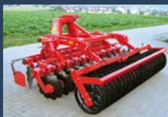
1170142 POM Stac

Yr. 2009, GBP 4,366.00, Wilfried Mezger & Partner GbR, Tel.: +49 7156 959204, info@mezger-landtechnik.de, Break-back system, Folding system, Spring tines