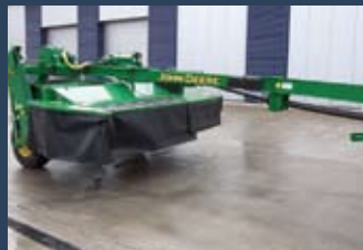
1165953 John Deere 530