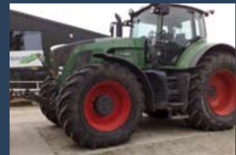
1146897 Fendt 936 Profi

Yr. 1998, GBP 39,100.00, Gebr. Drees Agrartechnik GmbH & Co. KG, Tel.: +49 2571 80070, info@drees.de, Air-conditioning, all-wheel-drive, Cab, ELC, Front axle suspension