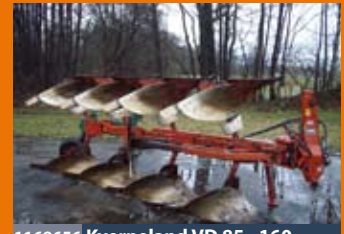
1168656 Kverneland VD 85 - 160

GBP 13,750.00, J Brock & Sons, Tel.: +44 1371 830 353, info@jbrockandsons.com, on land