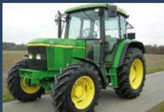
1160803 John Deere 6210 SE

Yr. 1993, GBP 9,500.00, Peirsons Ltd, Tel.: +44 1630 638 477, +44 7710 510 446, peirsons@tiscali.co.uk, all-wheel-drive, Cab