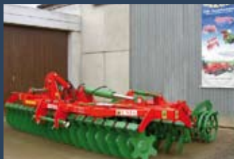
1171310 Unia Ares T XL Yr. 2009, GBP 10,150.00, Wilfried Mezger & Partner GbR, Tel.: +49 7156 959204, info@mezger-landtechnik.de, Chassis, Deflector plates/tines, Folding system, Hitch