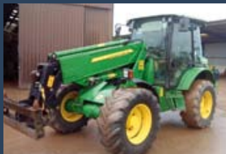
1172388 John Deere 3800

Yr. 2004, GBP 18,950.00, Southmoor Farm Machinery, Tel.: +44 1363 83 210, +44 7813 848 728, neil@sfmsales.eclipse.co.uk, boom suspension, air con, pickup hitch