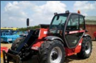
1173447 Manitou MLT 630

Yr. 2000, GBP 17,000.00, Maschinenhandel Höing, Tel.: +49 2542 955555, +49 171 3823488, info@mhg-maschinen.com, Auxilliary hydraulic circuit, Cab