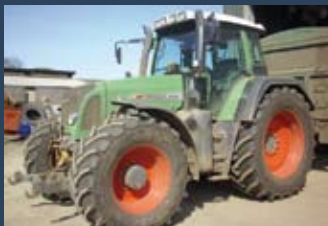
1150512 Fendt 818

Yr. 2006, GBP 54,500.00, Chandlers (Farm Equipment) Ltd, Tel.: +44 1476 590 077, gavin.pell@chandlersfe.co.uk, Air-conditioning, all-wheel-drive, Cab, Front linkage