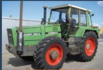
1168640 Fendt 626LSA

Yr. 1982, van Dijk, Tel.: +31 493 313107, mark@vdie.nl, Air-conditioning, all-wheel-drive, Cab, ELC, Hydraulic steering assist system, Pneumatic system