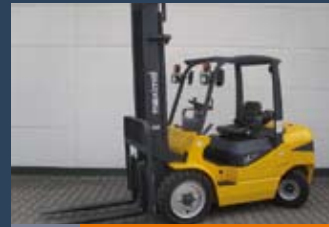
958757 MAXIMAL FD 30

Yr. 2005, GBP 39,500.00, Chandlers (Farm Equipment) Ltd, Tel.: +44 1476 590 077, gavin.pell@chandlersfe.co.uk, Air-conditioning, all-wheel-drive, Cab, comfort pack