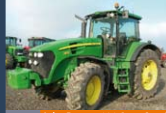
1118542 John Deere 7830 Auto Quad