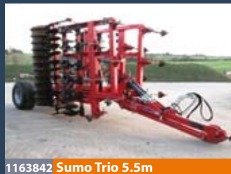
1163842 Sumo Trio 5.5m Yr. 2008, GBP 39,800.00, J Brock & Sons, Tel.: +44 1371 830 353, info@jbrockandsons.com, Rear Multipacker, parallel drawbar