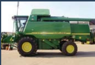
1179669 John Deere 9580 WTS