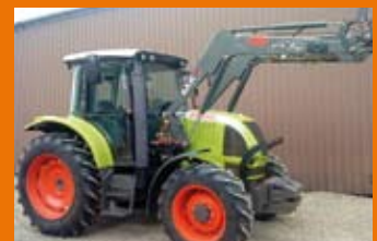
1172385 Claas Ares 567 ATX

Yr. 2005, GBP 142,000.00, Ben Burgess & Co, Tel.: +44 1603 628 251, enquiries@benburgess.co.uk, Terra-Trac, v900 auto-contour header, 3d sieves, 1 laser pilot