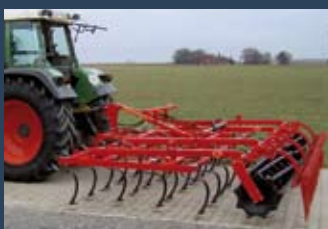
1168447 POM Meteor