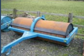
1131804 8ft Roll

Europe's biggest Internet-Exchange for used machinery with over 2,000 machines in the UK!