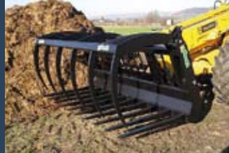
1014429 Albutt Hardox fork & grab