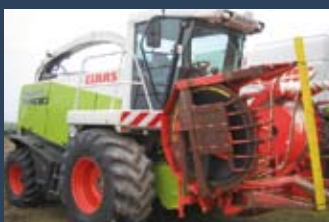
1134401 Claas Jaguar 850

Yr. 2007, GBP 27,500.00, Southmoor Farm Machinery, Tel.: +44 1363 83 210, +44 7813 848 728, neil@sfmsales.eclipse.co.uk, 40k, air con, 90% tyres, weights