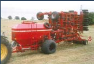
1163850 Horsch CO12

Yr. 2001, GBP 38,700.00, J Brock & Sons, Tel.: +44 1371 830 353, info@jbrockandsons.com, Steering axle, Duett coulters, Radar