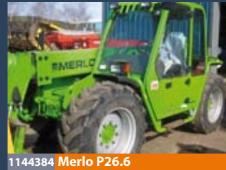
1144384 Merlo P26.6

Yr. 2003, GBP 23,500.00, J & S Lewis Ltd, Tel.: +44 1942 682 828, +44 780 328 5770, andrew@jslewis.co.uk, Air-conditioning, 40kpg, PUH, Good condition