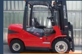
1043073 MAXIMAL FD 30 T

Yr. 2009, GBP 13,048.00, HEP Gabelstapler GmbH, Tel.: +49 2152 987210, +49 151 11588675, info@hep-gabelstapler.de