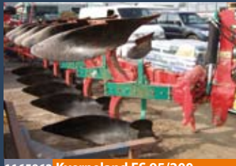
1165962 Kverneland ES 95/200

Yr. 1995, GBP 3,950.00, Thames Valley Machinery, Tel.: +44 1235 555 737, +44 7764 835, mike@tvmachinery.com, 6m drill, Following harrow, ceramic tips, tidy