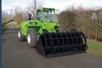
1014444 Albutt Bucket & Grab

GBP 850.00, R E S Tractor & Mach Services, Tel.: +44 1949 861615, carole@restractors.co.uk, 8ft Roll - shop soiled