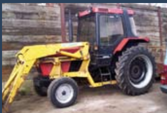
1147584 Case IH 856XL

Yr. 1990, GBP 4,500.00, Peirsons Ltd, Tel.: +44 1630 638 477, +44 7710 510 446, peirsons@tiscali.co.uk, Cab, Front-end loader, Low profile cab