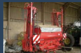
1160831 Kuhn Aero 2218