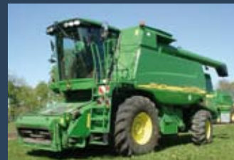
1166402 John Deere 9680i WTS

Yr. 2002, GBP 70,000.00, climate control, 20ft autocontour header, trolley, chopper, Ben Burgess & Co, Tel.: +44 1603 628 251, enquiries@benburgess.co.uk