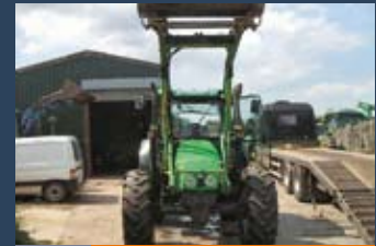
1177719 Deutz-Fahr AGROPLUS 95