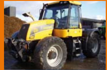
1160279 JCB 3185 Smoothshift

Yr. 1995, GBP 10,000.00, J E Buckle Engineers Ltd, Tel.: +44 1438 861 257, gary@jebuckle.co.uk, all-wheel-drive, Knight 20m Demount Sprayer, 2000Ltr Tank