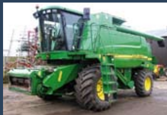
1179652 John Deere 9640

Yr. 2004, GBP 77,500.00, hydro, air con, greenstar monitor, electric sieves, chopper, chaff spreader, Ben Burgess & Co, Tel.: +44 1603 628 251, enquiries@benburgess.co.uk