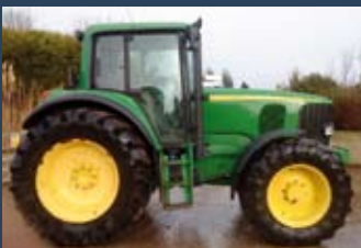
1172387 John Deere 6620

GBP 11,500.00, Southmoor Farm Machinery, Tel.: +44 1363 83 210, +44 7813 848 728, neil@sfmsales.eclipse.co.uk, L reg, 40k, power quad, air con, good back tyres