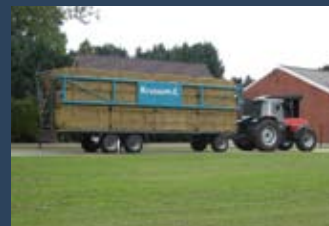
379087 Krassort bale trailer

Yr. 2008, GBP 195,500.00, A1-Traktor.de, Tel.: +49 4282 9327 35, kontakt@a1-traktor.de, all-wheel-drive, Chaff spreader, Self-levelling system