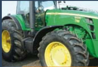
1170921 John Deere 8430

Yr. 2007, GBP 92,000.00, 16F/5R speed powershift - 40k, pickup hitch with drawbar & hook, Ben Burgess & Co, Tel.: +44 1603 628 251, enquiries@benburgess.co.uk