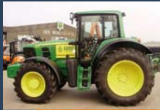
1179786 John Deere 6930P

Yr. 2008, McGill Tractors, Tel.: +44 2820 762 749, +44 7703 605 744, mcgilltractors@aol.com, Auto Quad, Air Brakes