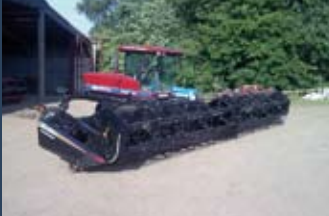
1176593 Macdon 9352c

GBP 3,215.00, HAGEMEIER, Tel.: +49 4265 1365, axelhagemeier@freenet.de, Disc coulters, Packer arm