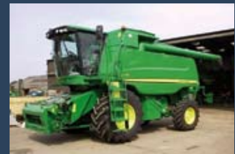
1179639 John Deere C670i

Yr. 2006, GBP 122,400.00, A1-Traktor.de, Tel.: +49 4282 9327 35, kontakt@a1-traktor.de, Air-conditioning, Anti-yaw system, Board computer, Cab, Header trailer