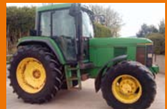
1172401 John Deere 6600

GBP 34,700.00, J Brock & Sons, Tel.: +44 1371 830 353, info@jbrockandsons.com, 690 hours, power quad plus, immaculate