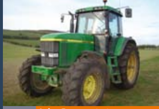
1172427 John Deere 7810