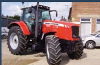
1174901 Massey Ferguson 6485