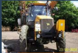
1065942 JCB 1115