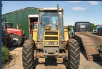
1165996 Renault 103.14TX Yr. 1987, GBP 4,750.00, Peirsons Ltd, Tel.: +44 1630 638 477, +44 7710 510 446, peirsons@tiscali.co.uk, all-wheel-drive, Cab, 4WD TURBO TRACTOR