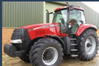
1174357 Case IH 310

R E S Tractor & Mach Services, Tel.: +44 1949 861615, carole@restractors.co.uk, Axel Trailer. Tyres front and back very good.