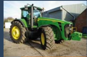
1101550 John Deere 8530

Yr. 2009, GBP 109,500.00, 16 X 5 powershift transmission, with 30k/h nominal speed, Ben Burgess & Co, Tel.: +44 1603 628 251, enquiries@benburgess.co.uk