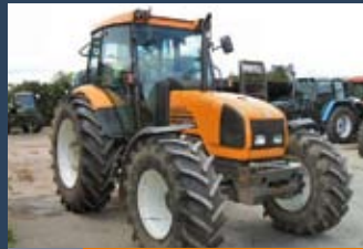
1165995 Renault 355-4WD Yr. 2001, GBP 12,500.00, Peirsons Ltd, Tel.: +44 1630 638 477, +44 7710 510 446, peirsons@tiscali.co.uk, Air-conditioning, all-wheel-drive, Cab