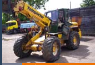
1173080 Sanderson Teleporter TX52 Yr. 1993, GBP 5,850.00, H J Knight & Son, Tel.: +44 1243 575333, +44 7850 856150, hjk.eastashling@yahoo.co.uk, Auxiliary hydraulic circuit, Cab, Quick attach carriage