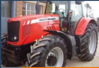
1132116 Massey Ferguson 6495

Yr. 2006, GBP 46,000.00, Chandlers (Farm Equipment) Ltd, Tel.: +44 1476 590 077, gavin.pell@chandlersfe.co.uk, all-wheel-drive, 4wd Tractor