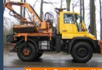
1167467 Mercedes-Benz Unimog U 40