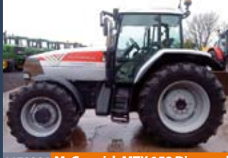
1172384 McCormick MTX 150 Diamond

Yr. 2009, GBP 13,047.00, HEP Gabelstapler GmbH, Tel.: +49 2152 987210, +49 151 11588675, info@hep-gabelstapler.de