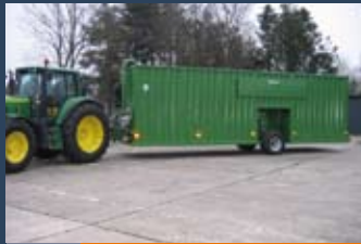
1142347 Slurry containers Yr. 2009, Krassort Maschinen & Anlagenbau GmbH, Tel.: +49 2583 300920, kontakt@krassort.com