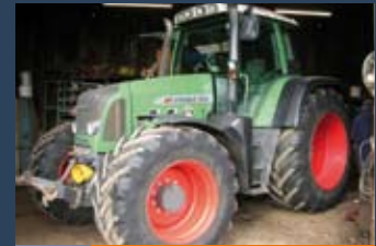
1154896 Fendt 818

Yr. 2002, GBP 45,050.00, Gebr. Drees Agrartechnik GmbH & Co. KG, Tel.: +49 2571 80070, info@drees.de, Air-conditioning, all-wheel-drive, Cab, ELC, Front-end loader