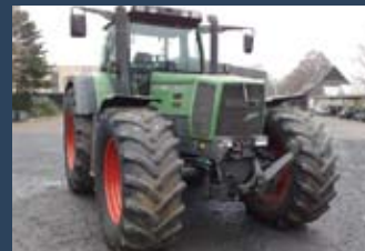
1073105 Fendt 920 Vario

Yr. 1996, GBP 37,786.00, Tel.: +49 9563 2567, +49 171 9456831, Steffen.Braecklein@gmx.de, Air-conditioning, all-wheel-drive, Cab, Creeper, ELC, Front axle suspension