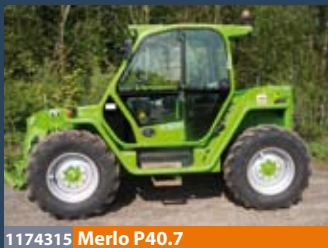
1174315 Merlo P40.7

Yr. 2000, GBP 13,900.00, Cooks Midlands Ltd, Tel.: +1 1530 249 191, +1 7966 261 818, bill@cooksmidlands.co.uk, Merlo 28.7EVT, Pick up hitch, 8900 hours