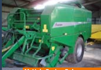
1144437 McHale Fusion Bale wrapper

Yr. 2007, GBP 25,950.00, Southmoor Farm Machinery, Tel.: +44 1363 83 210, +44 7813 848 728, neil@sfmsales.eclipse.co.uk, cab suspension, front axle suspension